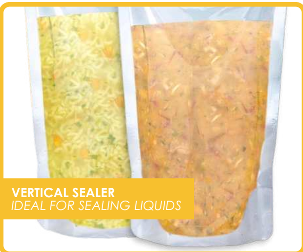
VERTICAL SEALER IDEAL FOR SEALING LIQUIDS