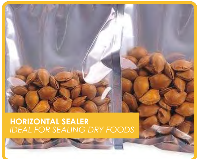
HORIZONTAL SEALER IDEAL FOR SEALING DRY FOODS