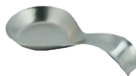
SPOON REST SRC0001 210MM - S/STEEL