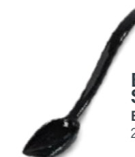
BUFFET SPOON SOLID BSS3300 250MM