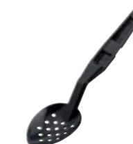
PERFORATED DELI SPOON PPS0028 33CM