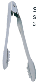
SPRING TONG STS0023 245MM - S/STEEL