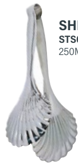
SHELLY TONG STS0001 250MM - S/STEEL