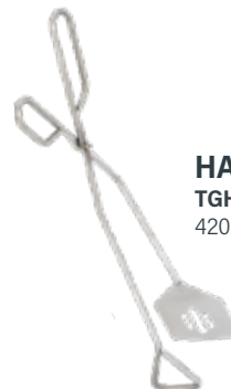
HAMBURGER TURNER TGH0420 420MM