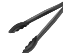
SCALLOP TONG STB0230 - 23CM STB0350 - 30.5CM