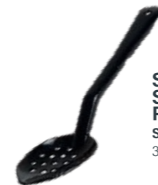
SERVING SPOON PERFORATED SSP3330 330MM