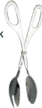
SERVING TONGS BUF0009 SCISSOR TYPE