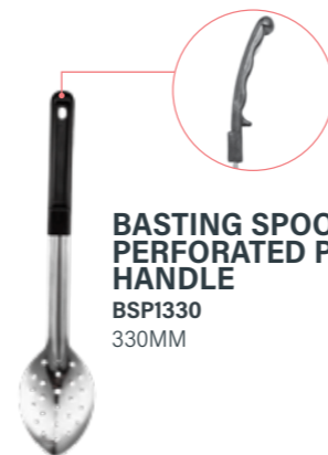
BASTING SPOON PERFORATED PVC HANDLE BSP1330 330MM