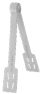
PASTRY TGP1200 240MM