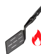
SLOTTED TURNER HHT0330 33.5CM