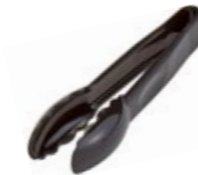
SCALLOP TONG STB0150 15CM