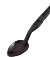
POLYCARBONATE SOLID SPOON PSS0028 28CM L