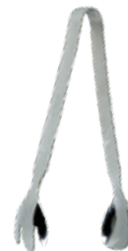
CATERING TGC0210 210MM