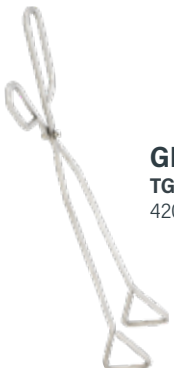
GRILL/BRAAI TGG0420 420MM