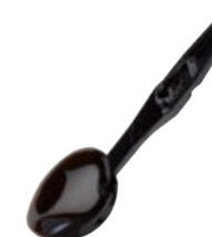
POLYCARBONATE SOLID SPOON PSS0033 33CM L (12)