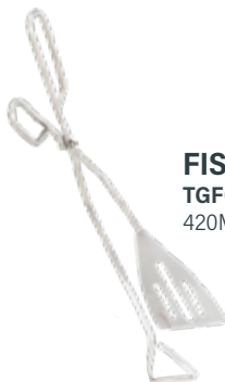
FISH TURNER TGF0420 420MM