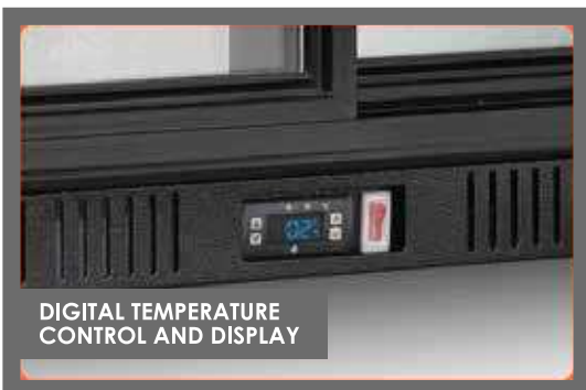
DIGITAL TEMPERATURE CONTROL AND DISPLAY